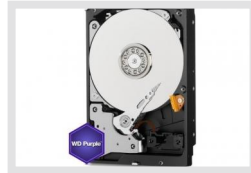
HDD-8000SATA Purple | SKU: 218583