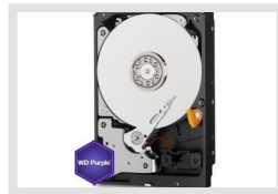
HDD-2000SATA Purple | SKU: 217658