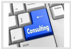
CON-HDD eneo | SKU: 216959