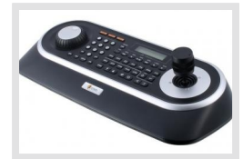
KBD-2USB | SKU: 217652