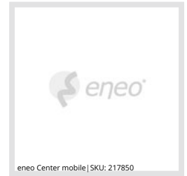
eneo Center mobile | SKU: 217850