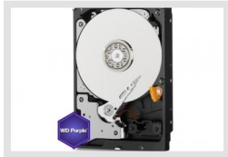
HDD-4000SATA Purple | SKU: 217659