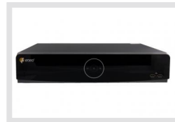
IEM-38R640005A | SKU: 217651